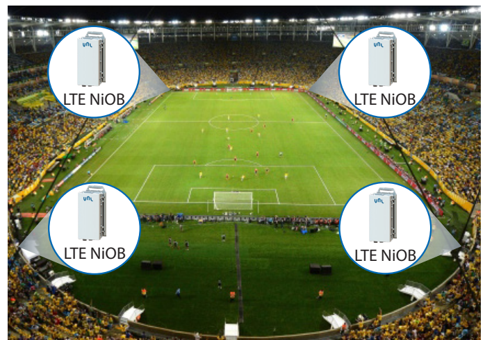
Broadband Cellular Coverage in Football Court

For further information visit our website www.vnl.in